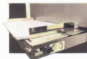
Revo Flex Sheet Feed Skew Adjustment.