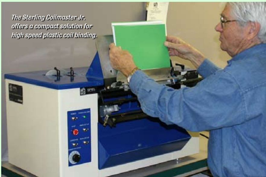
The Sterling Coilmaster Jr. offers a compact solution for high speed plastic coil binding.

Having sold its publishing division three years ago, Colorful Story Books now specializes