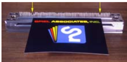
Pins pulled (above) and unpulled (below).

Double loop wire users are acquainted with the process of pulling pins. If a 3:1, or in the case of coil, a 4:1 pitch is used on an 8\frac{1}{2} x 11-inch book, or A4, you might punch a partial hole if you don't pull the two outside pins. Spiral binding veterans know what the only alternative was and is: Trim down your book so that the margin is no larger than the bridge. So the choice was clear: Pull your pins or trim down the book.